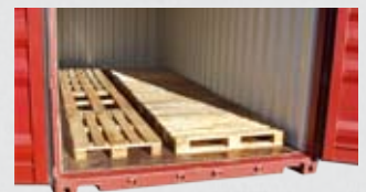
22 x EU 20 x UK

Standard features include flat flooring for ease of use, 130cm wide butchers door with internal release, internal lighting and alarm with 2 sirens, heater cables to prevent the formation of ice around the door frame, pressure equalizing valve and a thermometer beside the butchers' door.